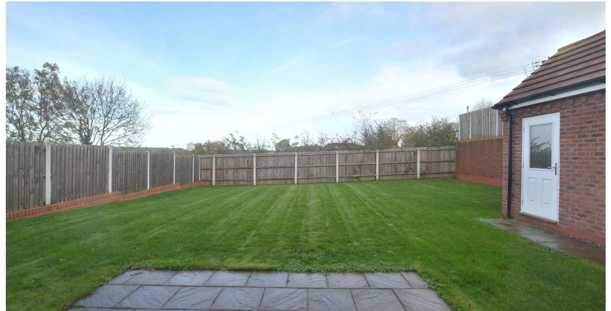
7 Thimble Mill Close, Shepshed, Leicestershire, LE12 9GF