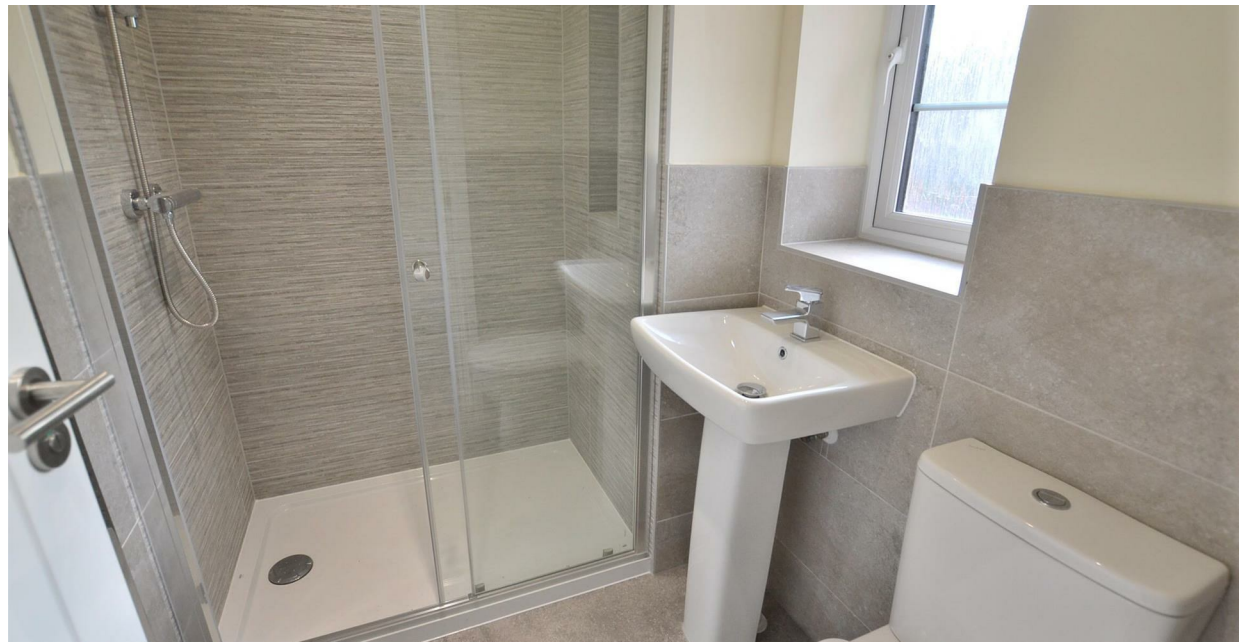
7 Thimble Mill Close, Shepshed, Leicestershire, LE12 9GF