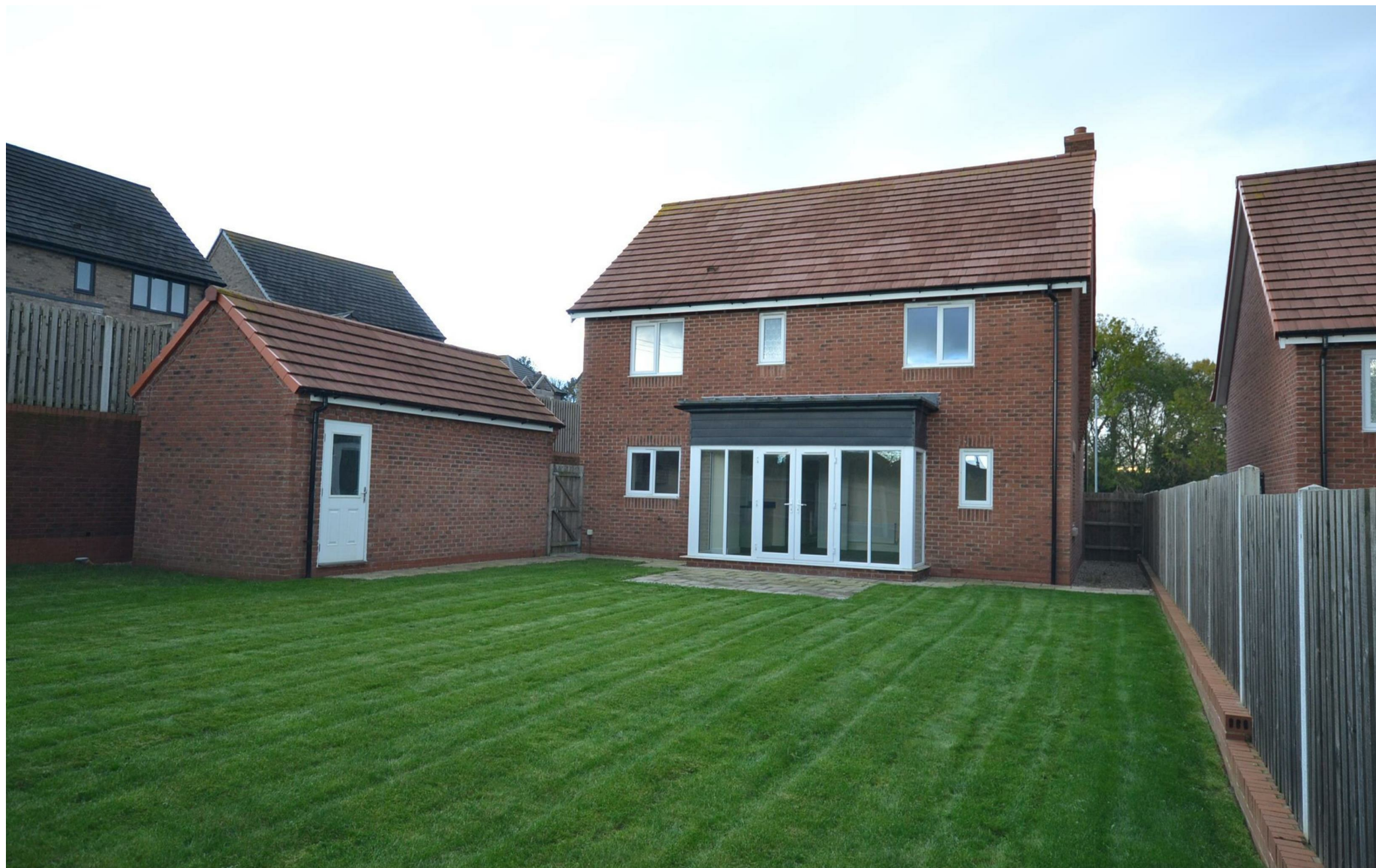
7 Thimble Mill Close, Shepshed, Leicestershire, LE12 9GF