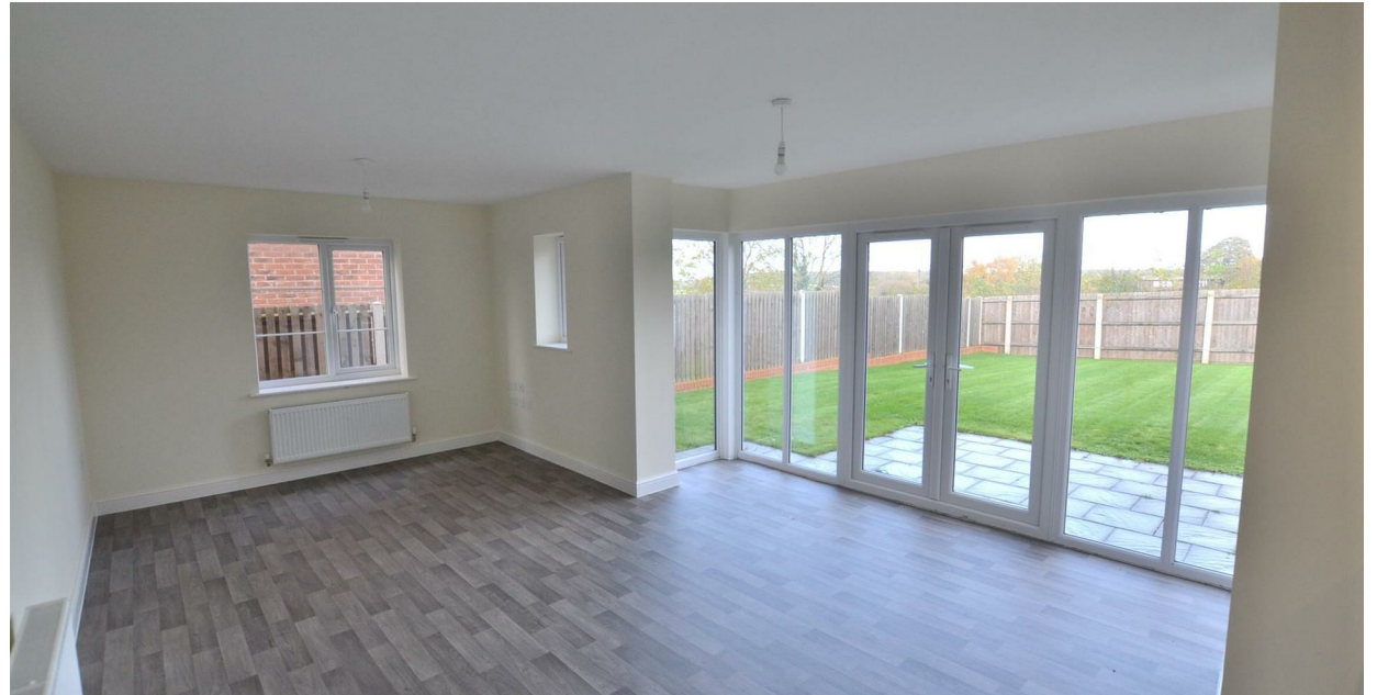
7 Thimble Mill Close, Shepshed, Leicestershire, LE12 9GF