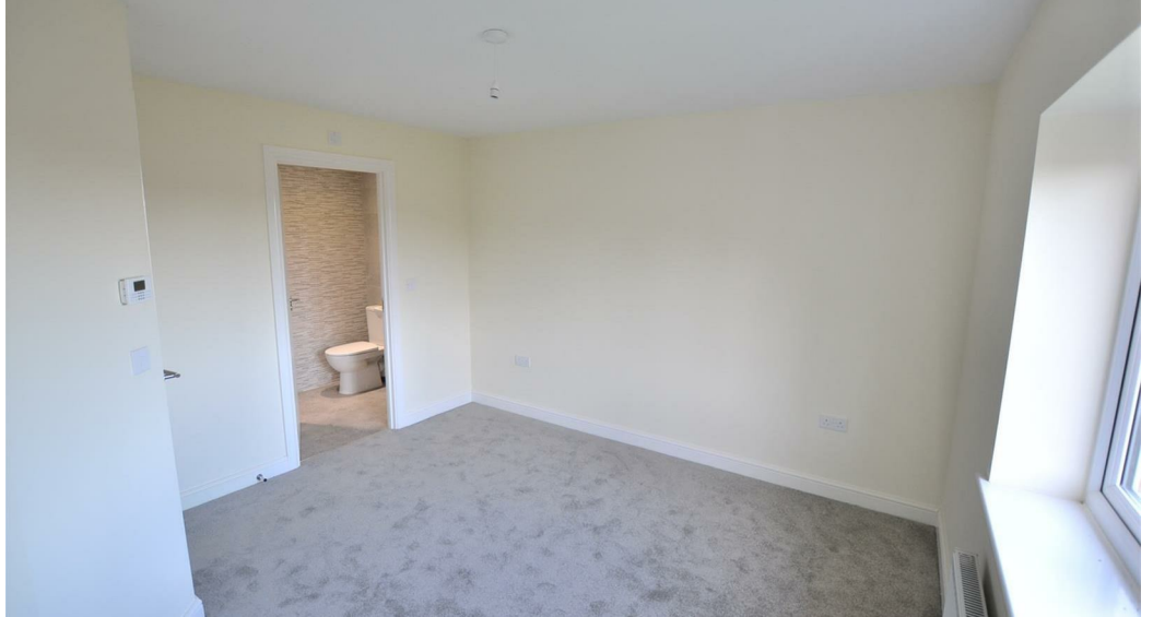
7 Thimble Mill Close, Shepshed, Leicestershire, LE12 9GF