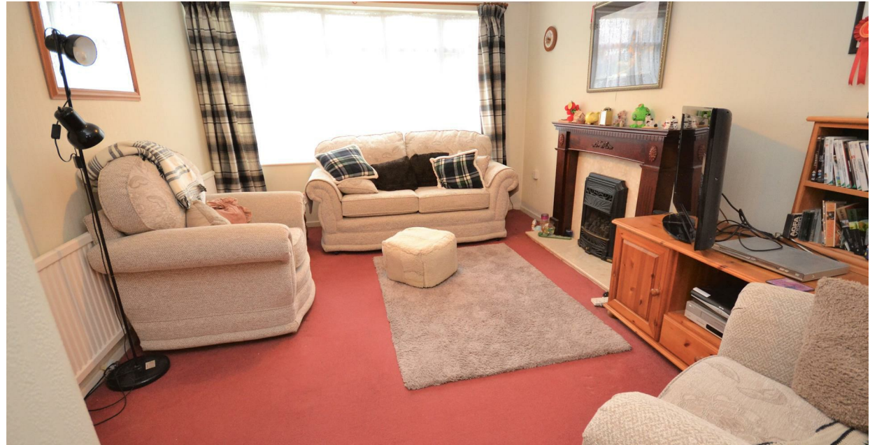
3 Sandringham Rise, Shepshed, Leics, LE12 9ND