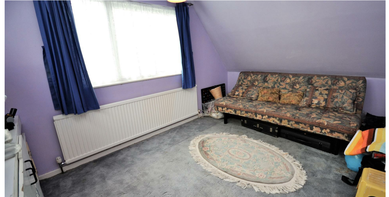
3 Sandringham Rise, Shepshed, Leics, LE12 9ND