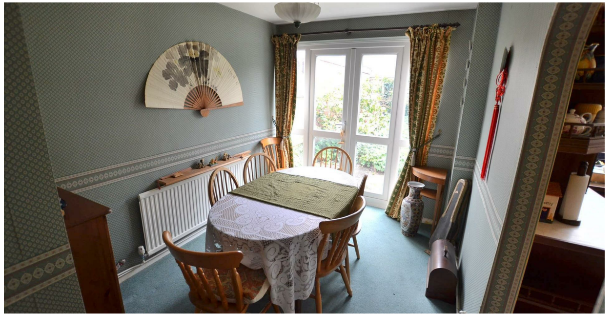
3 Sandringham Rise, Shepshed, Leics, LE12 9ND