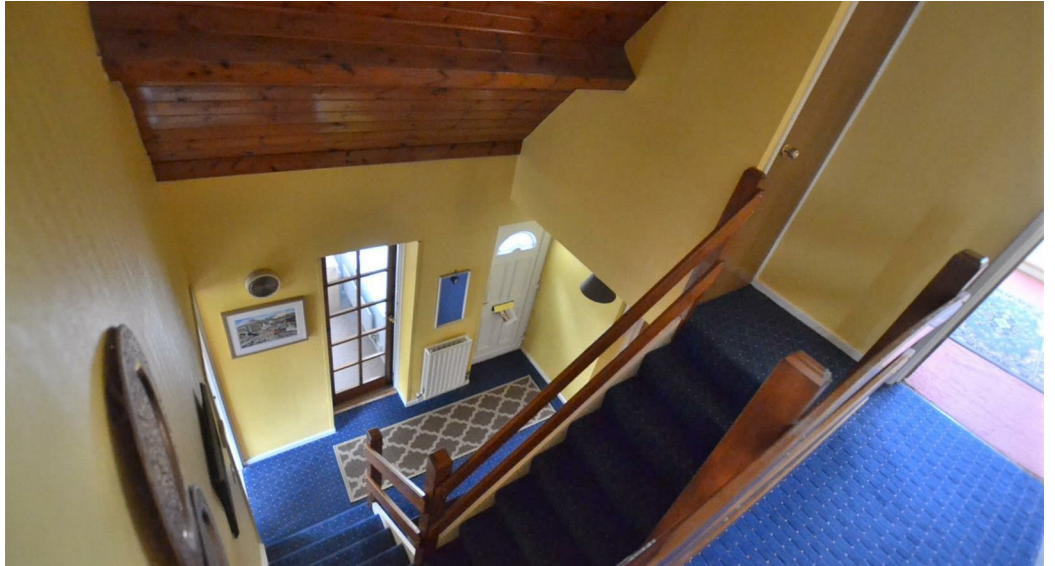
3 Sandringham Rise, Shepshed, Leics, LE12 9ND