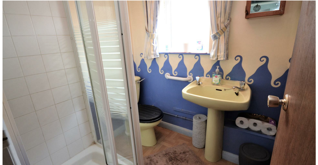
3 Cheviot Drive, Shepshed, Leicestershire, LE12 9ED