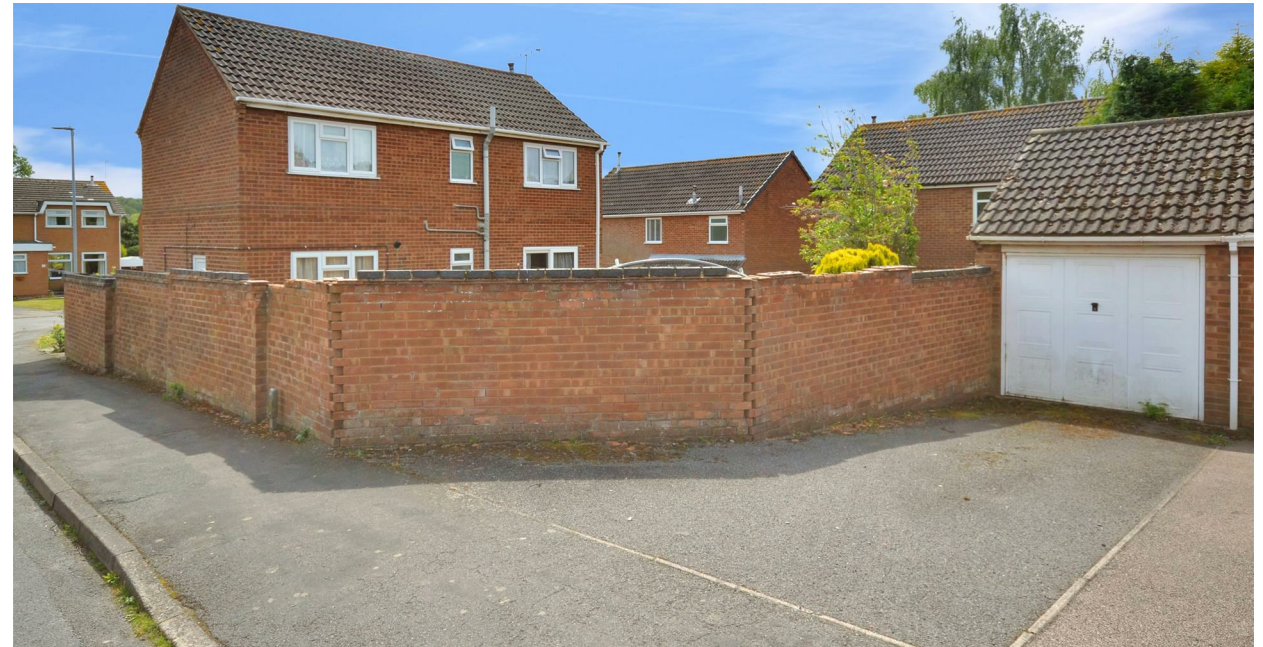
3 Cheviot Drive, Shepshed, Leicestershire, LE12 9ED