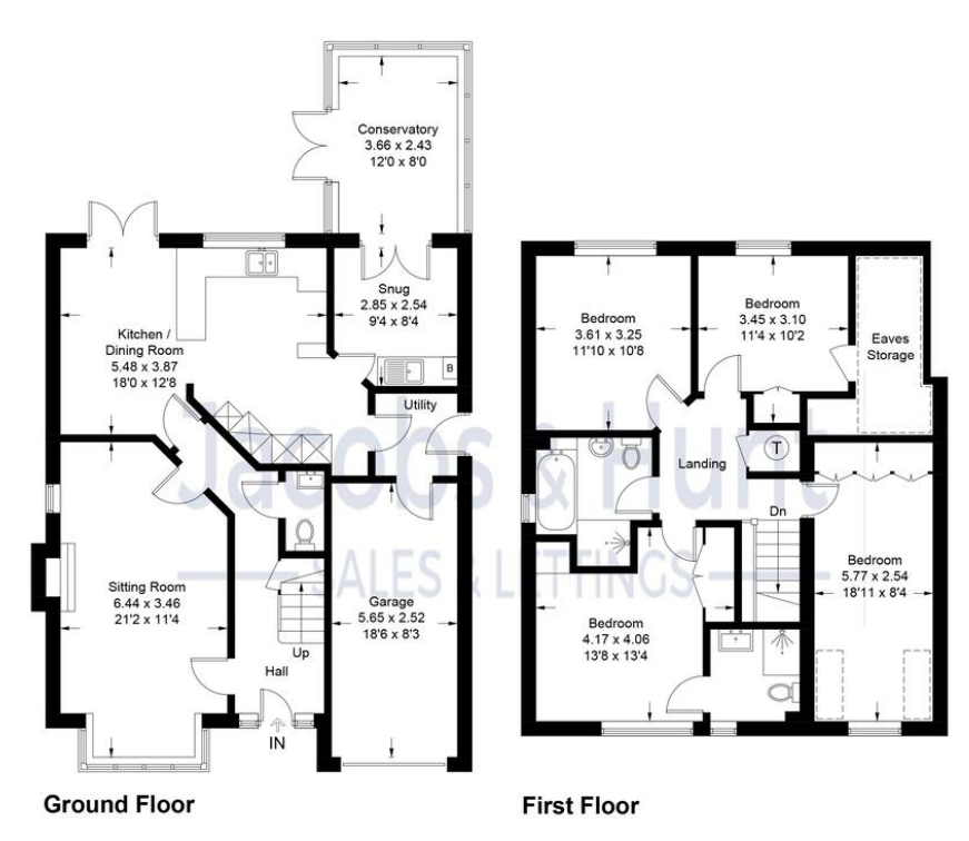
Illustration for identification purposes only, measurements are approximate, not to scale. (ID1168543)