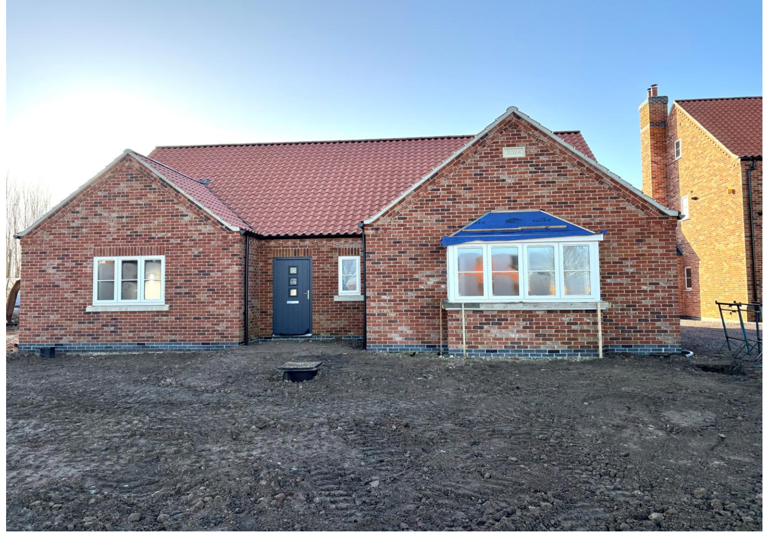
Plot 7, Moulton Chapel Road, Cowbit, Spalding PE12 0XD