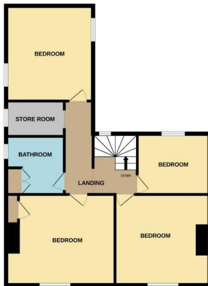
TOTAL FLOOR AREA : 1973 sq.ft. (183.3 sq.m.) approx.

Whilst every attempt has been made to ensure the accuracy of the floorplan contained here, measurements of doors, windows, rooms and any other items are approximate and no responsibility is taken for any error, omission or mis-statement. This plan is for illustrative purposes only and should be used as such by any prospective purchaser. The services, systems and appliances shown have not been tested and no guarantee as to their operability or efficiency can be given. Made with Metropix ©2024