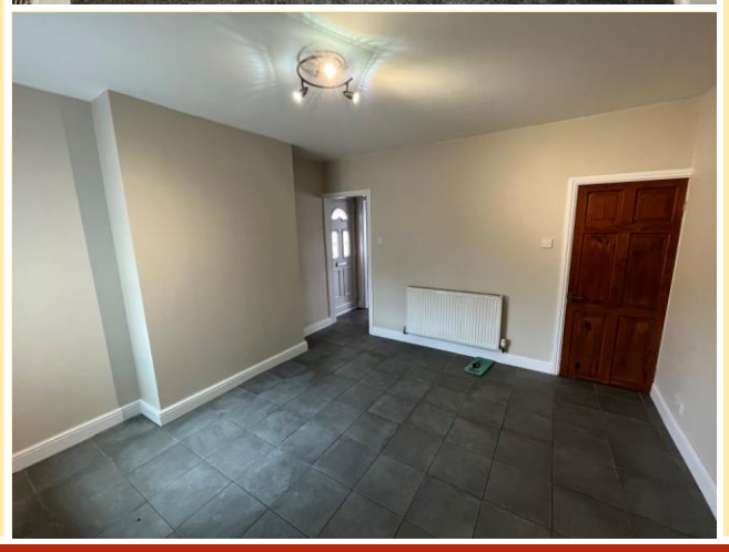
ACCOMMODATION Storm porch canopy and UPVC side entrance door with glazed panels to: