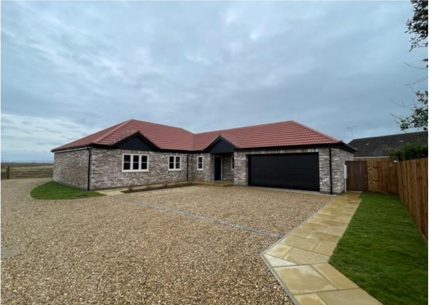
'The Maple- 'Rookery Grove', Beck Bank, West Pinchbeck, Spalding PE11 3QN

SPALDING RESIDENTIAL: 01775 766766 www.longstaff.com