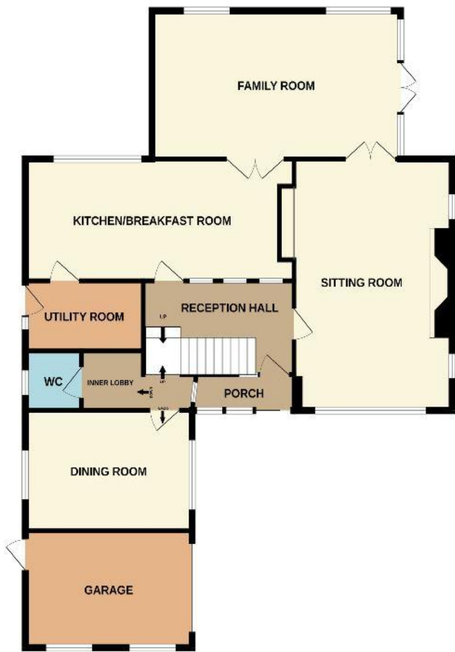
1ST FLOOR 855 sq.ft. (79.4 sq.m.) approx.