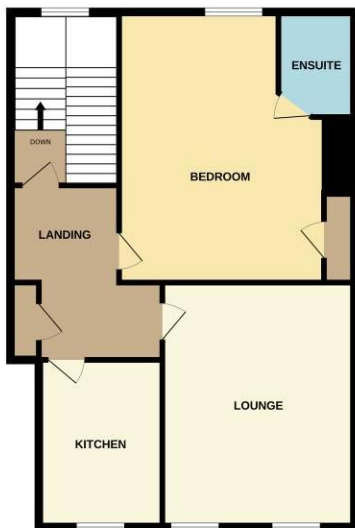
3RD FLOOR 812 sq.ft. (75.4 sq.m.) approx.