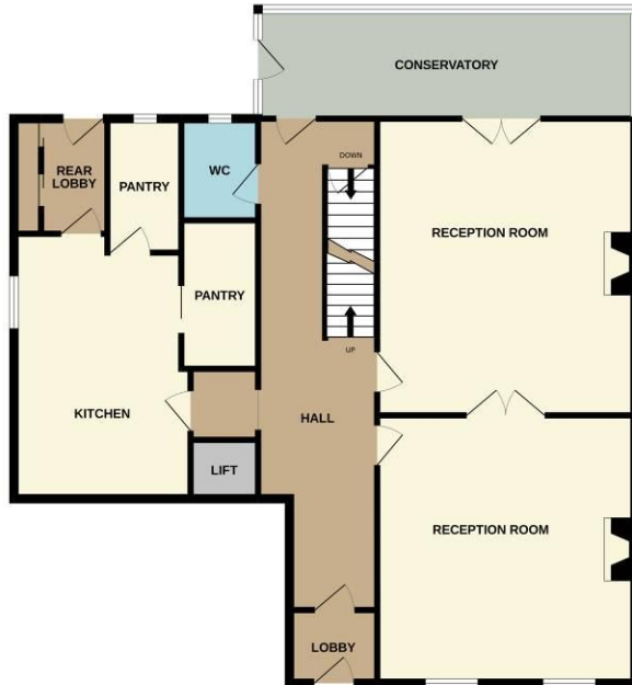
1ST FLOOR 1344 sq.ft. (124.8 sq.m.) approx.