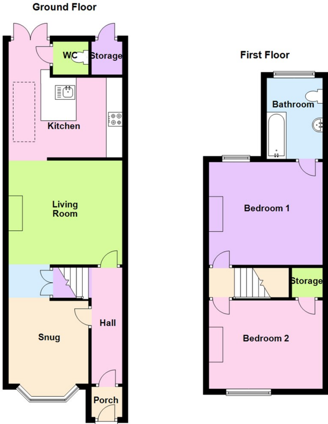
Illustration For Identification Purposes Only. Not To Scale. Plan produced using PlanUp.