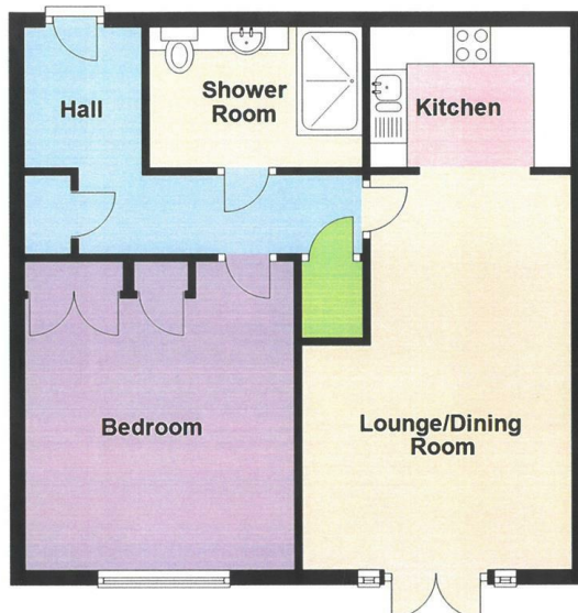
Floor Plan Approx. 636.8 sq. feet