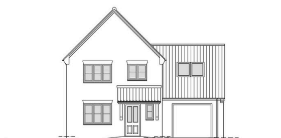
Front Elevation 6186