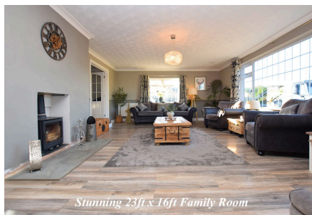
Stunning 23ft x 16ft Family Room