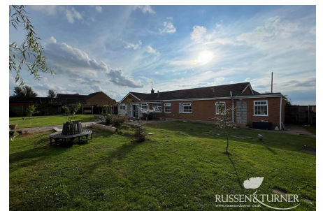
RUSSEN & TURNER www.russenandturner.co.uk

This charming Tilney Cum Islington bungalow has field views so stunning, you'll forget your morning coffee's gone cold. With three bedrooms (easily five), a sunrise-ready kitchen, and planning permission to extend (Ref: 14/00695/F), it's the perfect countryside retreat—or your next project to create something even more special!