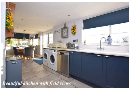
Beautiful kitchen with field views