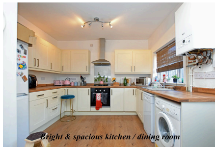
Bright & spacious kitchen / dining room