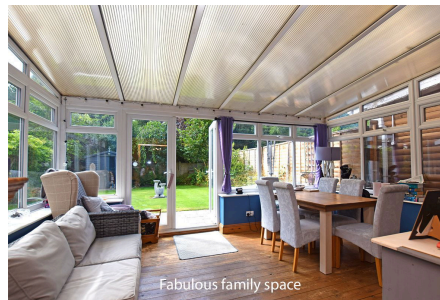
Fabulous family space