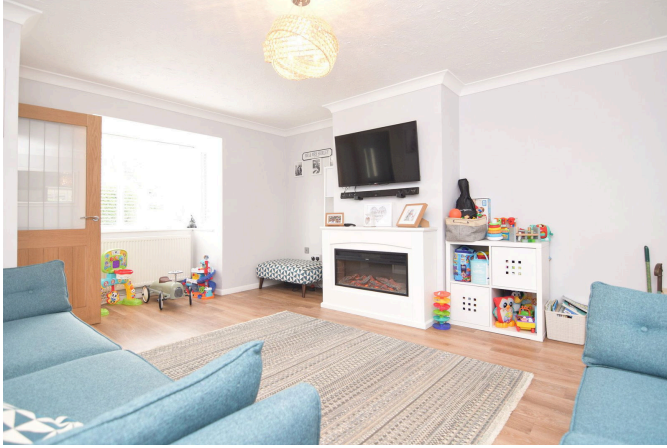
GROUND FLOOR 421 sq.ft. (39.1 sq.m.) approx.

COMMERCIAL PROPERTY SURVEYORS & VALUERS BUILDING & PARTY WALL SURVEYORS ARCHITECTURAL DESIGNERS ESTATE AGENTS