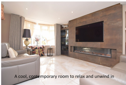
A cool, contemporary room to relax and unwind in