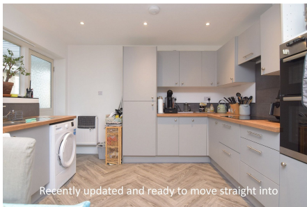
Recently updated and ready to move straight into