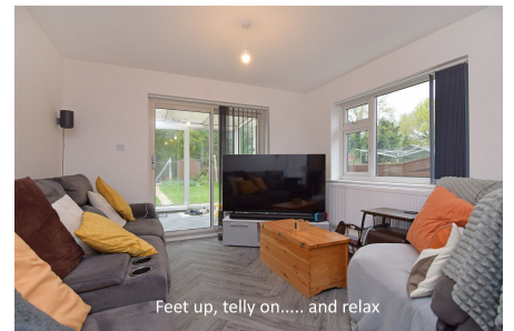
Feet up, telly on..... and relax

READY TO MOVE INTO!! Set opposite fields, this extended, three bedroom, link detached bungalow has recently undergone modernisation. It boasts a fantastic level of superbly presented accommodation that has been coupled with a generous garden, ample parking and an attached single garage.