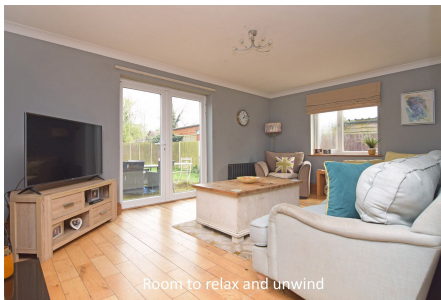
Room to relax and unwind