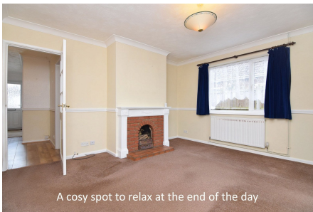
A cosy spot to relax at the end of the day

RUSSEN & TURNER www.russenandturner.co.uk