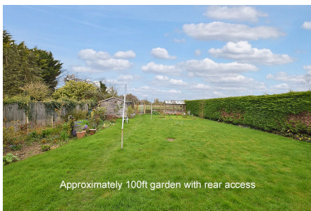
Approximately 100ft garden with rear access