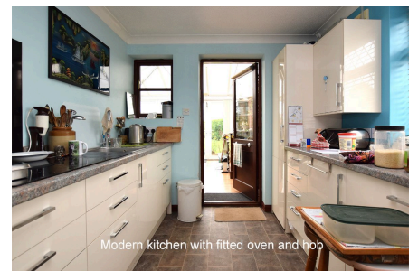
Modern kitchen with fitted oven and hob

How would you like to wake up each morning and being able to enjoy open views across the Norfolk countryside? This detached bungalow is set on a generous plot with ample parking for several vehicles and boasts 2 double bedrooms and a superb conservatory which is the ideal spot from where to enjoy a view of the garden with a cup of tea or a glass of wine with friends. The bungalow has oil central heating and is available with no onward chain.