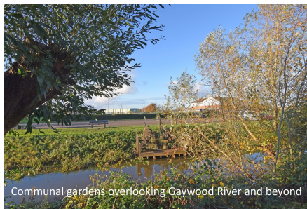
Communal gardens overlooking Gaywood River and beyond