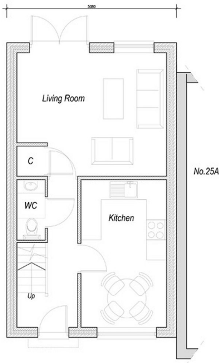
Proposed Ground Floor Plan Scale: 1:50