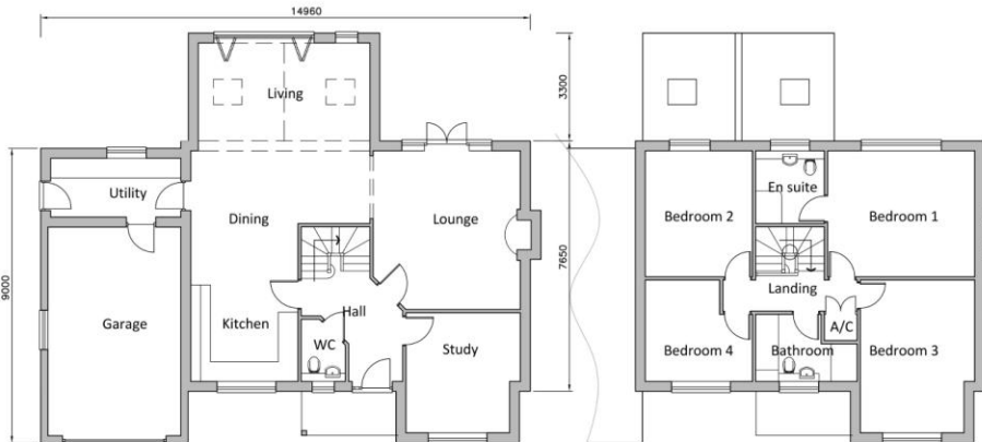
Ground Floor Layout 1:100