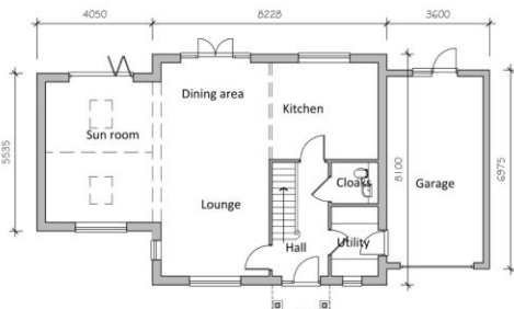
Ground Floor Layout 1:100