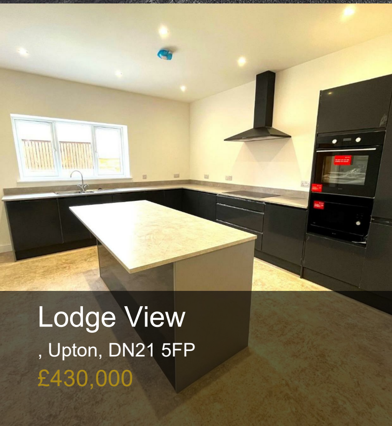
Lodge View , Upton, DN21 5FP £430,000