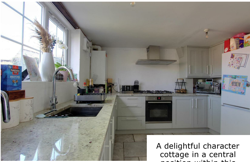
A delightful character cottage in a central position within this sought after Herts village close to Tring.