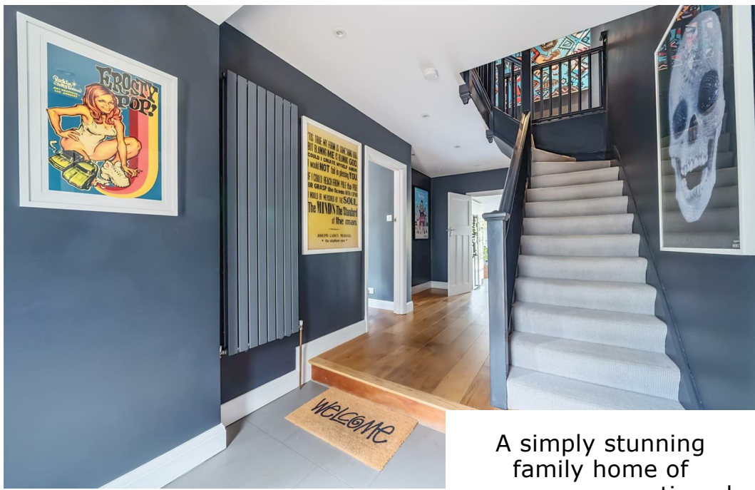
A simply stunning family home of generous proportions and with a flexible layout.