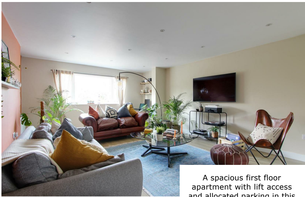
A spacious first floor apartment with lift access and allocated parking in this sought after apartment block close to the town and amenities.