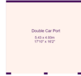
(Not in Orientation) Area: 26.7 m 2 ... 288 ft 2

Total Area: 238.4 m 2 ... 2566 ft 2 All measurements are approximate and for display purposes only