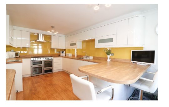
Field Close £415,000

Kettlebrook, Tamworth, Staffordshire, B77 1BW