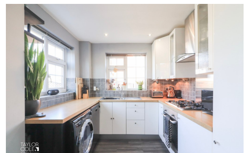
Beechwood Crescent Amington, Tamworth, , B77 3JH