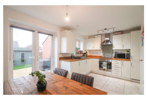
Meadow Way Barley Fields, Tamworth, B79 0DY