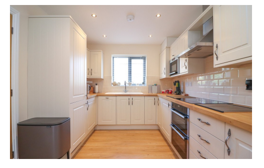
Ashbrook Lane Abbots Bromley, Rugeley, Staffordshire, WS15 3DW