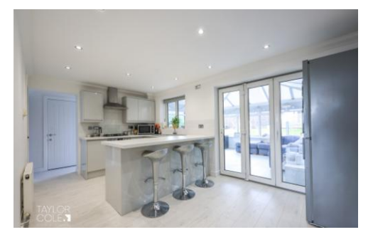
Sudeley Dosthill, Tamworth, , B77 1JU