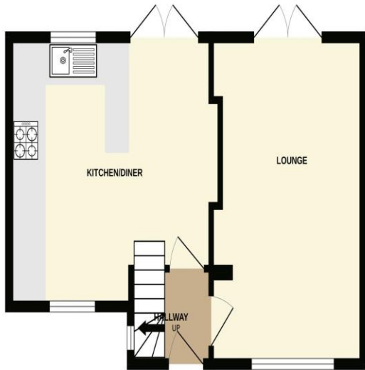
GROUND FLOOR 399 sq.ft. (37.0 sq.m.) approx.