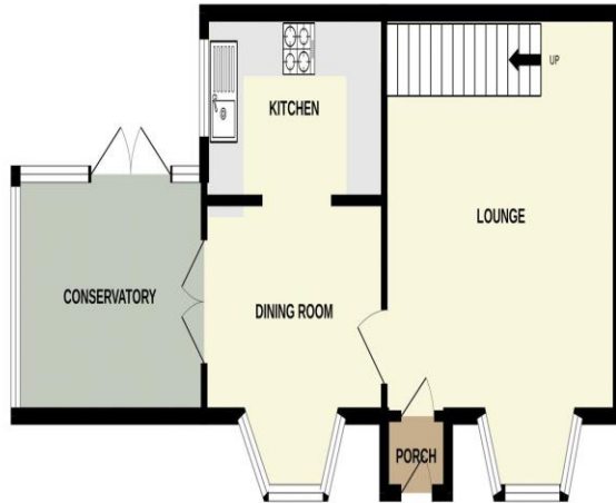
GROUND FLOOR 472 sq.ft. (43.8 sq.m.) approx.