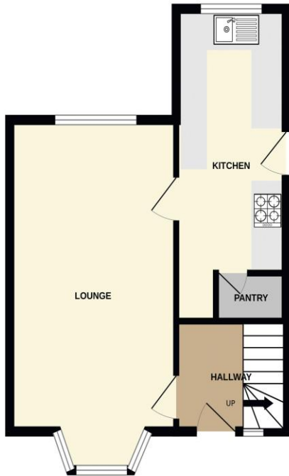
GROUND FLOOR 383 sq.ft. (35.6 sq.m.) approx.