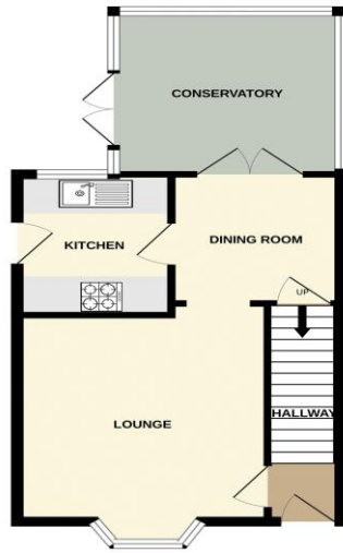
GROUND FLOOR 430 sq.ft. (39.9 sq.m.) approx.