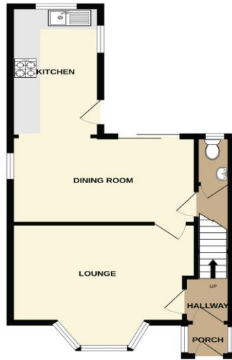
GROUND FLOOR 463 sq.ft. (43.0 sq.m.) approx.