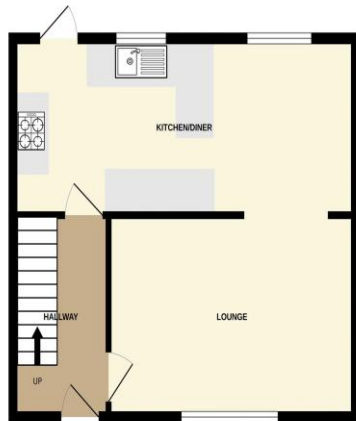
GROUND FLOOR 438 sq.ft. (40.7 sq.m.) approx.