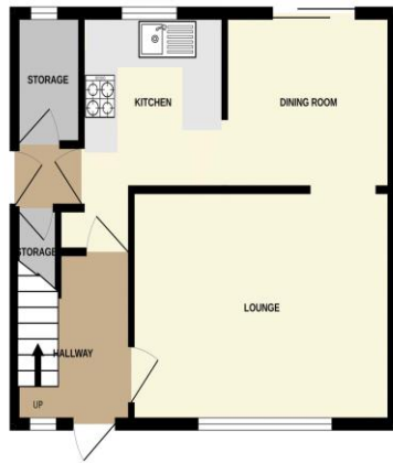
GROUND FLOOR 422 sq.ft. (39.2 sq.m.) approx.