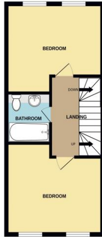
1ST FLOOR 394 sq.ft. (36.6 sq.m.) approx.