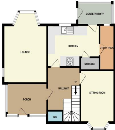
GROUND FLOOR 700 sq.ft. (65.0 sq.m.) approx.