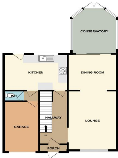
GROUND FLOOR 787 sq.ft. (73.1 sq.m.) approx.