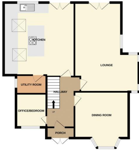
GROUND FLOOR 902 sq.ft. (83.8 sq.m.) approx.