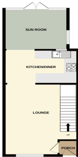
GROUND FLOOR 450 sq.ft. (41.6 sq.m.) approx.