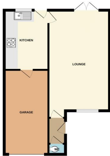
GROUND FLOOR 558 sq.ft. (51.8 sq.m.) approx.