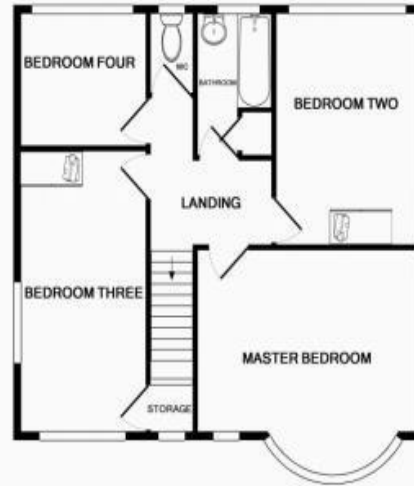
1ST FLOOR APPROX. FLOOR AREA 621 SQ.FT. (57.7 SQ.M.)

TOTAL APPROX. FLOOR AREA 1257 SQ.FT. (116.8 SQ.M.)